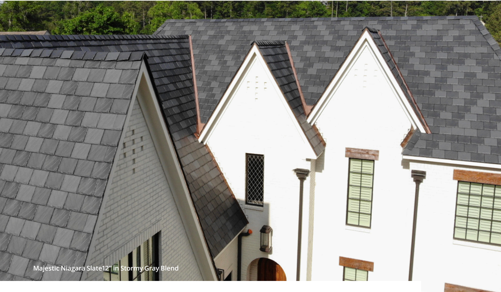
Majestic Niagara Slate 12" in Stormy Gray Blend