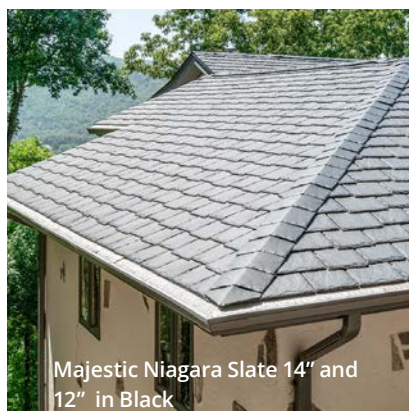
Majestic Niagara Slate 14" and 12" in Black