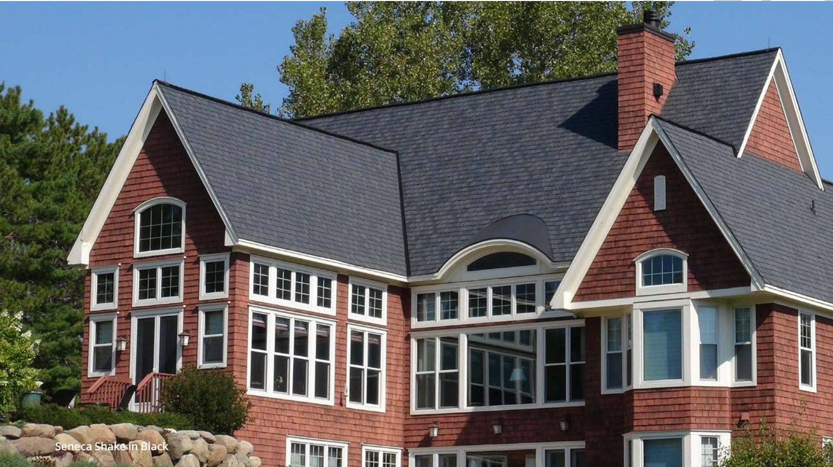
Seneca Shake in Black