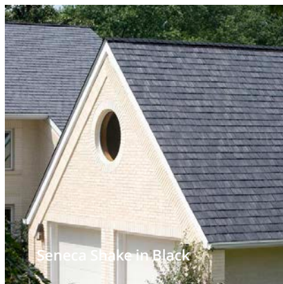
Seneca Shake in Black