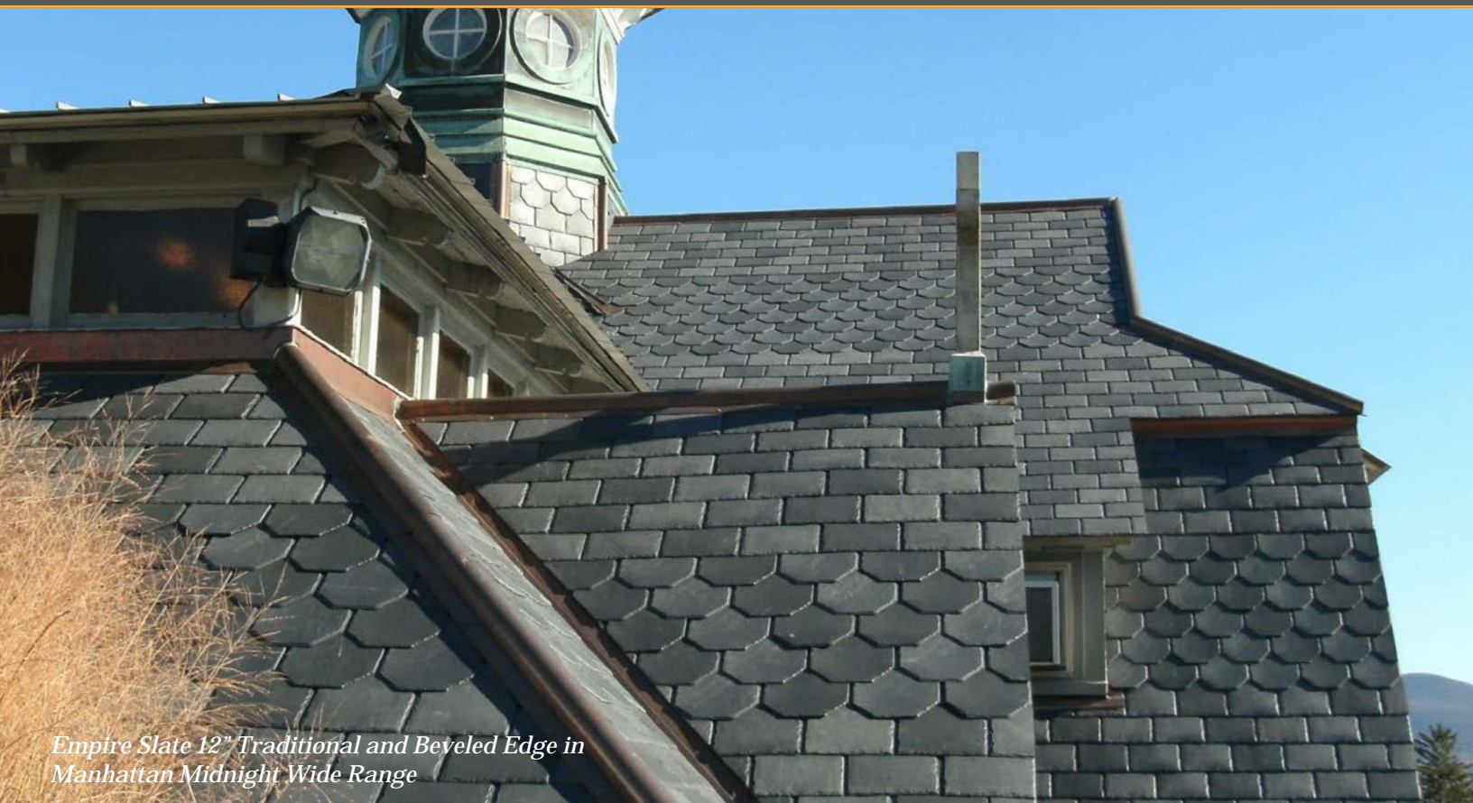
Empire Slate 12" Traditional and Beveled Edge in Manhattan Midnight Wide Range