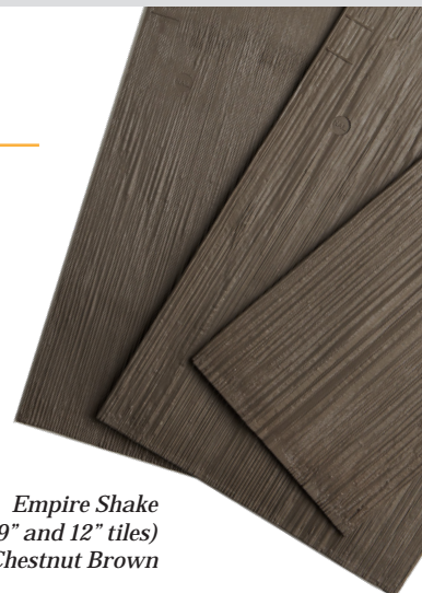
Empire Shake (6", 9" and 12" tiles) in Chestnut Brown